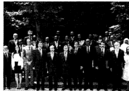
er, en Madrid lel Consejo Diplor mático de Casa África