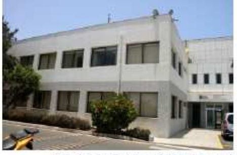
Sede de la PLOCAN en Tallarte (Foto TA)

Con el título Fomentando el desarrollo sostenible basado en una alta biodiversidad: Perspectivas de crecimiento verde y azul en las RUP y en los PTU, este evento inicia una serie de hitos y encuentros internacionales previstos por el proyecto NetBiome-CSA, que está dirigido a reforzar la cooperación en el campo de la investigación para la gestión sostenible de la biodiversidad en las RUP y en los PTU de la UE.