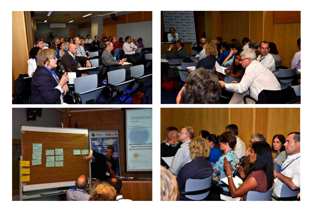
Photos 14, 15, 16, 17 - Plenary debate with participants of the conference.